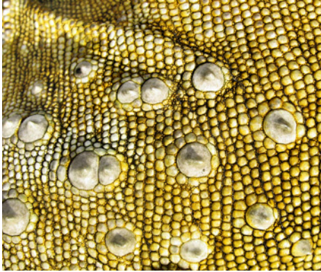
The scaly skin of a reptile is perfectly designed for its way of life. Any incipient change of the scales towards becoming feathers would be selected against, as the reptile would be less well protected.

Unlike Creation, evolution does not set out purposely to make something useful. In fact, if changes began to be made with a view to making, say, wings from scales, natural selection will eliminate the nascent change.