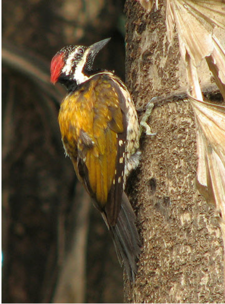
Woodpeckers are yet another example of irreducible complexity, requiring an integrated set of specialized features to make their lifestyle possible.

The Designer of the woodpecker's head has a prior claim to this multi-component system. All four parts are needed to stop Woody from beating its brains out.