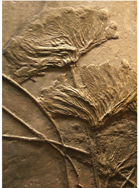
Fossilised fully articulated crinoids - showing they were buried very rapidly.

Is this evidence of evolution? The system of regulation, with DNA switches that control growth is clearly a design feature rather than natural selection acting upon mutations. Evolutionary progress brought about by losing switching mechanisms does seem strange.