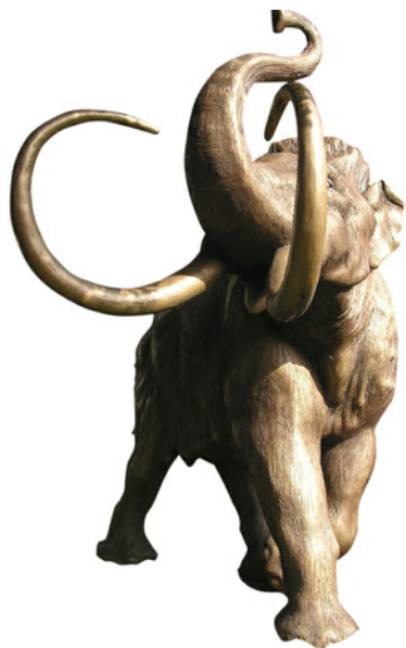
A woolly mammoth - one of a number of species of animals that died out following the end of the Ice Age.