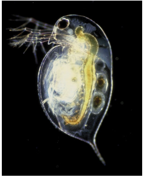
Lateral view of Daphnia pulex .

“It may be just 5 millimetres long, but the water flea packs in more genes than any species yet sequenced. With 30,907 genes, Daphnia pulex has at least 5000 more