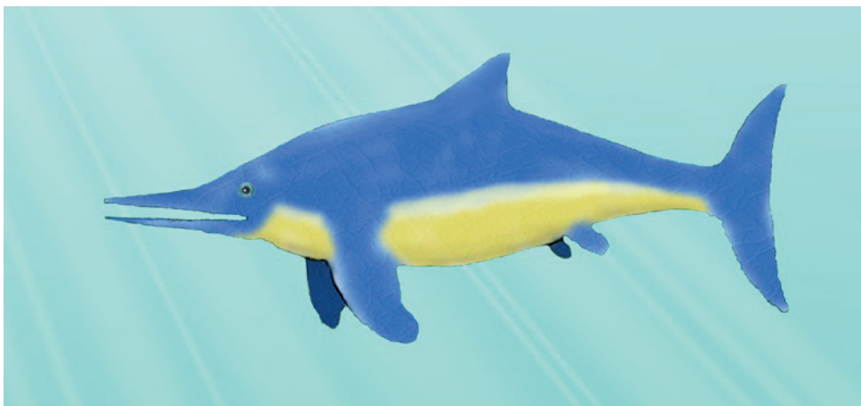
Artist's impression of the new ichthyosaur species, Acamptoneustes densus , in life. Image: CSM.

ichthyosaur in northern Germany in rocks that are supposedly 130 million years old. Thus according to evolutionists' reckoning the fossil dates from the Lower Cretaceous era, whereas most of the ichthyosaur fossils previously found date from the Jurassic era, millions of years older. The museum's paleontologist, Ulrich Joger, is reported to have told the BBC, "It's a spectacular find...it raises new questions about the [Jurassic] extinction theory!"