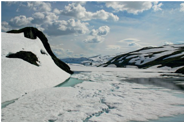
Water: innately beautiful and fine-tuned for life.

and that science classes should include creationism. Her rival, Texan governor Rick Perry, “advocates biblically based abstinence-only sex education. He argues that evolution is ‘a theory that is out there - and it’s got some gaps in it’. On climate change, Perry says ‘the science is not settled...just because you have a group of scientists that have stood up and said here is the fact...Galileo got outvoted